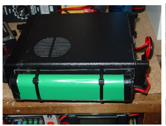
9.6V battery mounted – Side view