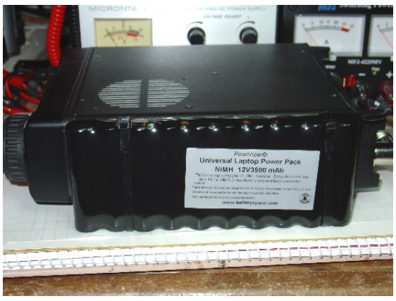
12V battery mounted – Side view