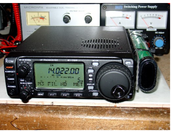
9.6V battery mounted – Front view