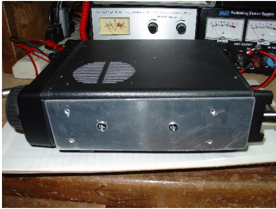
Aluminum plate mounted on IC-703