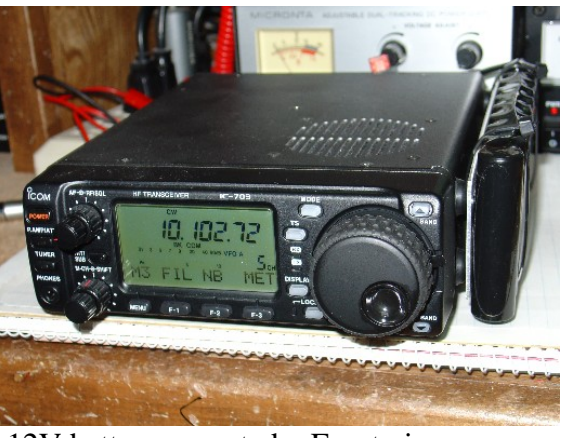
12V battery mounted – Front view