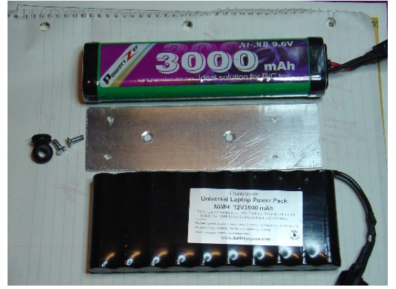
9.6V battery (top), parts (center), 12V battery (bottom)